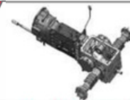
NEXT GENERATION TRANSMISSION