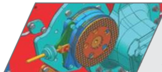
SUPER STRONG OIB