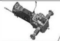
Next Generation Transmission