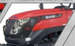
ADVANCE EUROPEAN AERODYNAMIC STYLING