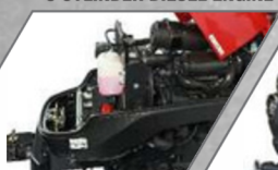
3 CYLINDER DIESEL ENGINE