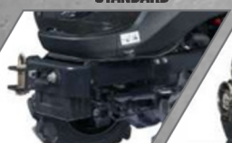
FRONT TOW HOOK STANDARD